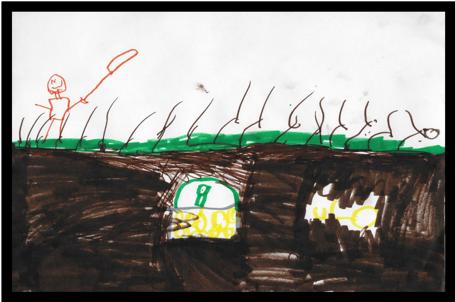
The Hidden Treasure